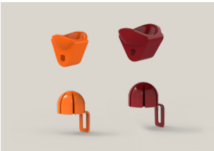
Juice extraction kits

A system developed by Zummo to assemble and disassemble the balls of the kit in just one movement.