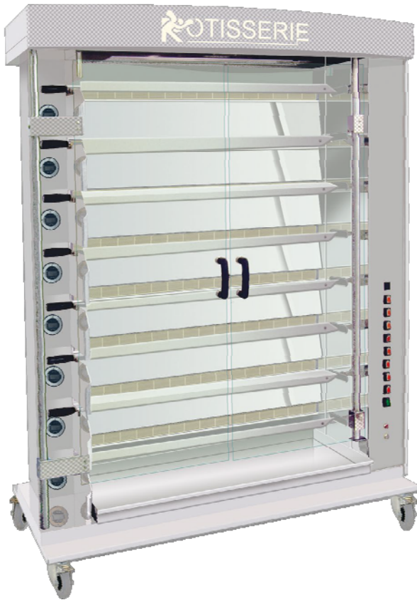
FF1425-8 on frame with casters (included)

The FauxFlame is Rotisol's response to commercial needs for performance accompanied by light weight, minimal size, and mobility. FauxFlame rotisserie ovens offer rapid cooking and quality results with the attractive display and mouth-watering aromas that customers love to find in the marketplace.