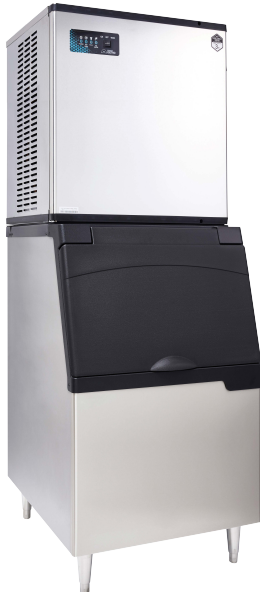
ICETRO IM-0350-22 ice machine on a IB-026-22 bin