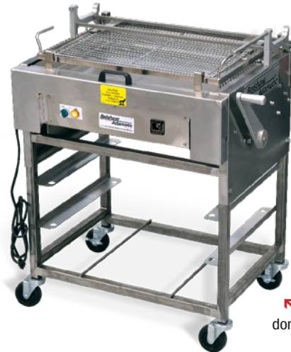
HI18F (with donut tray closed)