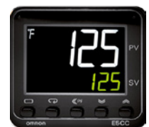
Electronic Temperature Controller