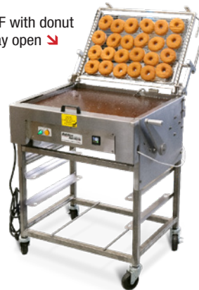
HI18F with donut tray open