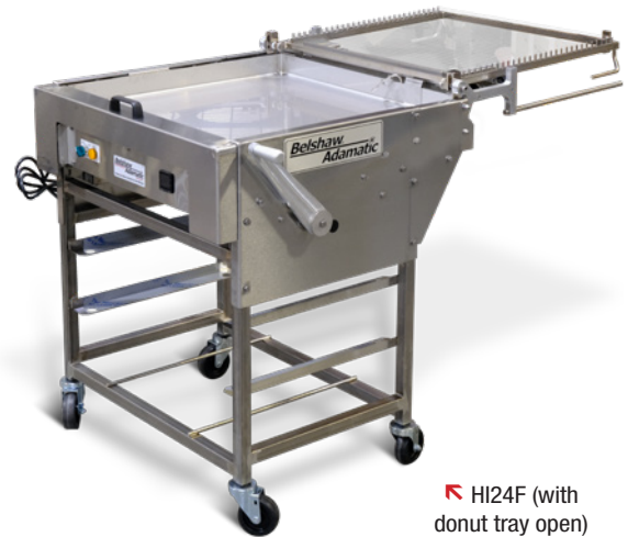
HI24F (with donut tray open)