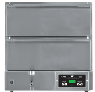
HBB5D2 CVAP HOLD/SERVE DRAWERS Electronic Differential Controls