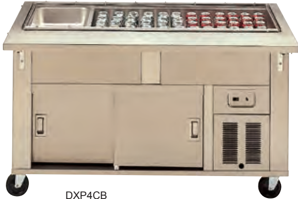
DXP4CB (shown with optional cutting board)