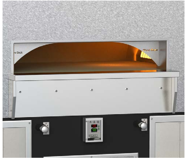
WS-FD-9660 model with stainless steel Mantle and stainless steel Mantle Bracket shown.

If you're planning to incorporate your Fire Deck Series oven into a kitchen design by applying facade materials, please visit the Facade Tutorials section on the Wood Stone website.