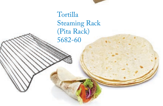
The Perfect Tortilla Steamer!

Steamer - Generator Cleaning Brush 8450-62