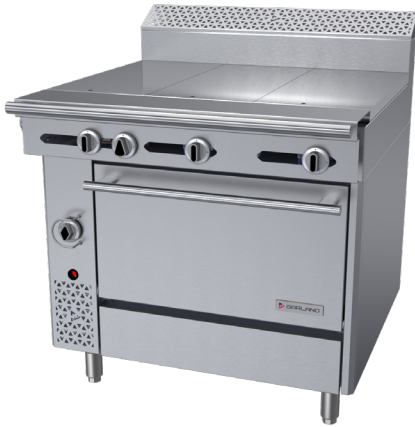
Model C36-8R Range with Three 12" Even Heat Hot Tops