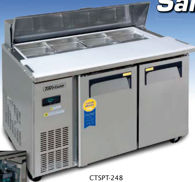
CTSP-248 48" Standard Side Mount Compressor