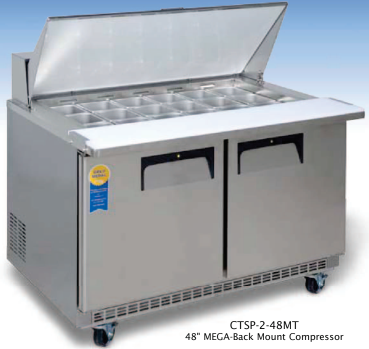
CTSP-2-48MT 48" MEGA-Back Mount Compressor