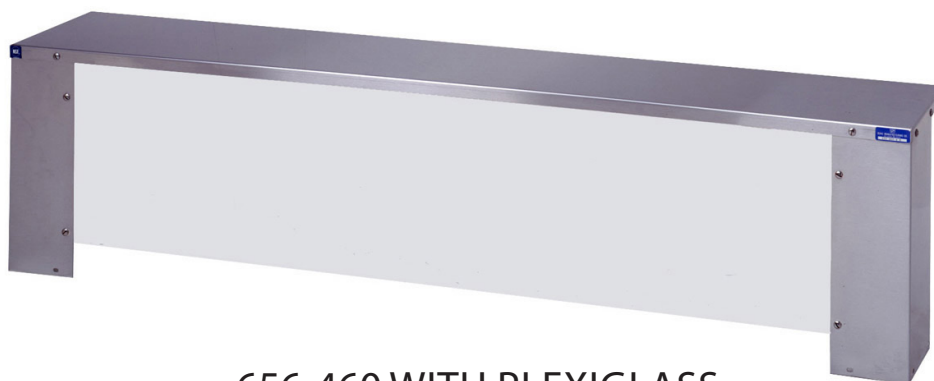
656-460 WITH PLEXIGLASS

CAUTION: Please read these instructions completely before attempting to install, operate or service this equipment.