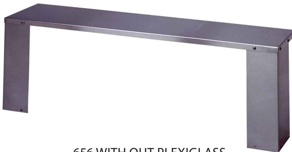
656 WITH OUT PLEXIGLASS