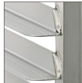
6000 Series Angle Guides and Welds