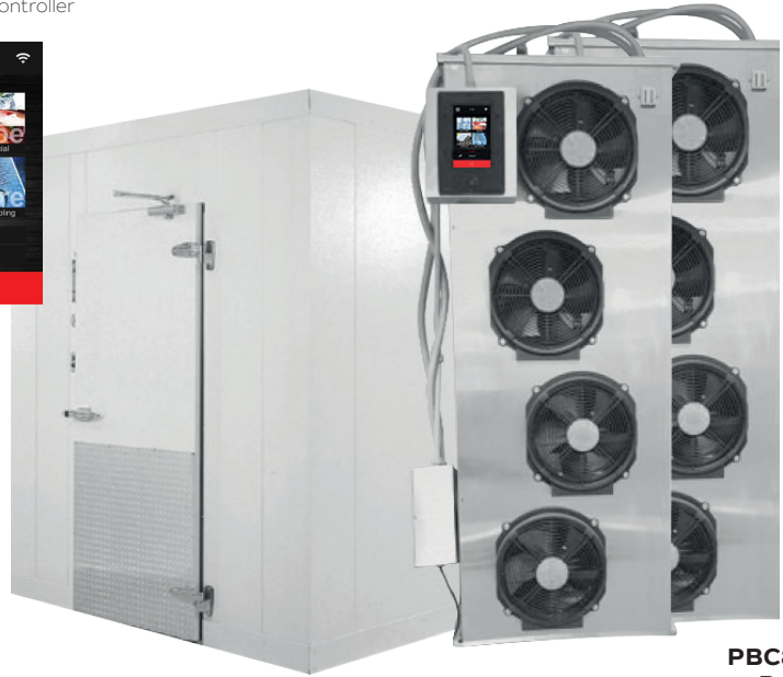
PBC850-TS P/N 5979