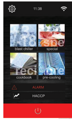
Touch screen controller

Standard features include a NEW advanced touch screen controller with USB port, holding cycle (once your cycle is completed the unit automatically switches over to a cooler), a single point product core probe, and up to 99 customized recipe programs.