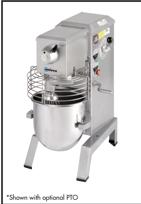
*Shown with optional PTO