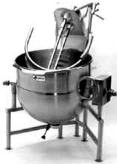
Model TWT-80 with mixer and optional bottom mounted butterfly valve