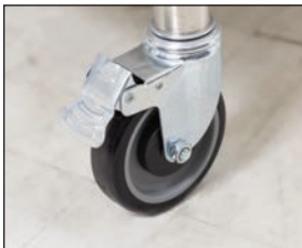
Heavy Duty Casters With Brakes On All Four Legs

TOP is 14 gauge, Type "304" Series stainless steel. SHELF is 18 gauge, Type "304" Series stainless steel. LEGS are 1 5/8" diameter stainless steel with stainless heavy duty casters.