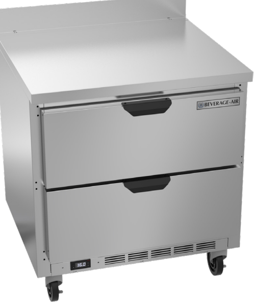
*Note: Shown with optional full electronic control