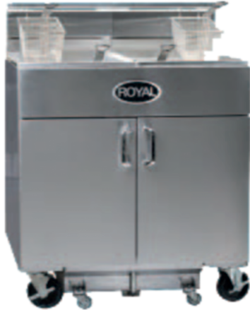
RFT-75-2-EM with optional casters

Models: RFT-75-2-XX RFT-75-3-XX RFT-75-4-XX RFT-75-5-XX