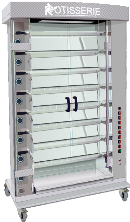
FF1175-8 on 1175 frame with casters (included)

The FauxFlame is Rotisol's response to commercial needs for performance accompanied by light weight, minimal size, and mobility. FauxFlame rotisserie ovens offer rapid cooking and quality results with the attractive display and mouth-watering aromas that customers love to find in the marketplace.