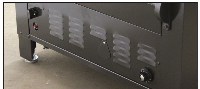
Easy access front controls