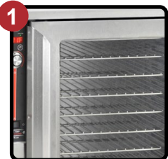
See-Thru Lexan Door