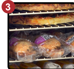
Hold Hot and Fresh Food