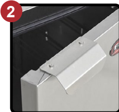
Magnetic Work Flow Handle