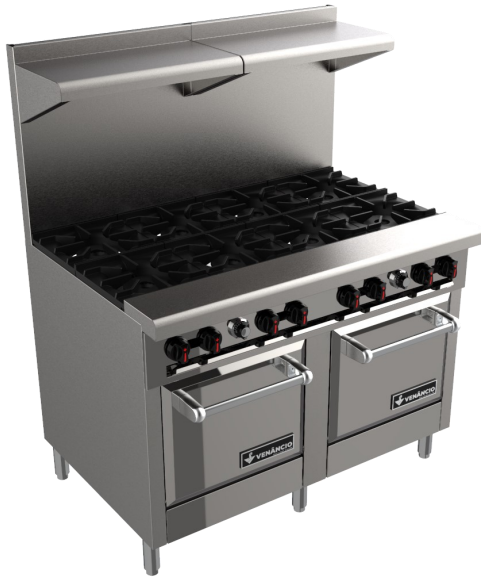
Model R 48 2ST - 48 B

100% manufactured from raw materials providing the highest quality and durability