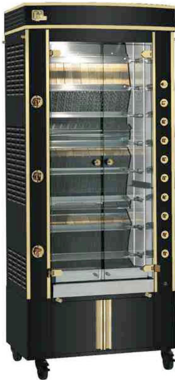
GF975-8 Gas + Roof + Base Cabinet SSP: Stainless steel with Black enamel front panels

Rotisol's GrandFlame Rotisserie Ovens epitomize beauty and functionality, featuring a unique cooking system. Visible flames & elegant finishes provide atmosphere, quality & design provide dependability and spit options and accessories allow for increased diversity.