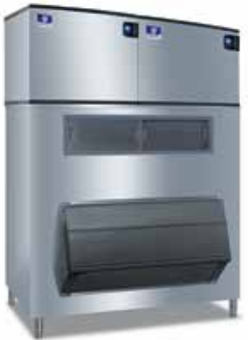
CVD Condensing Unit***