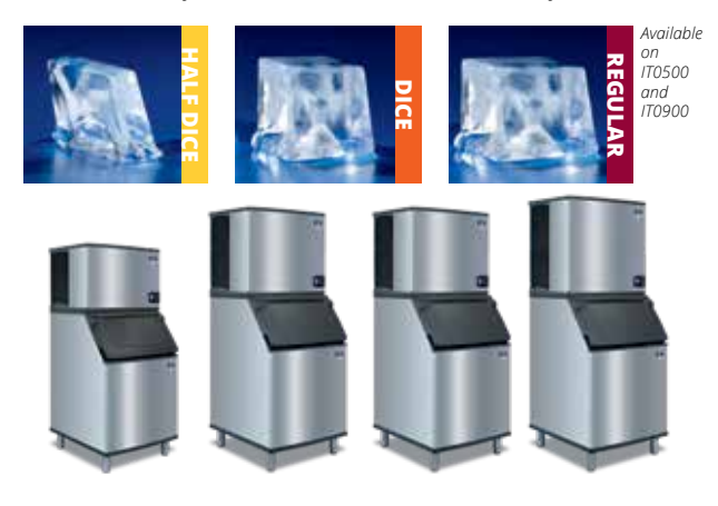
IT0750 D-570 Bin

By far the most popular size ice machine in the industry— The Indigo NXT 30" (76cm) platform offers the widest array of daily production, cube types, and condensing options available on the market today. With production capacities ranging from 310 lbs (141 kg) to 1,951 lbs (885 kg), three available cube types, and condensing options that include air, water, traditional air remote, and Manitowoc's patented QuietQube<sup>®</sup> CVD<sup>®</sup> remote technology (see pages 14-17), this series has an ice machine for just about every situation whether in a full-service restaurant, a fast-food chain, a convenience or grocery store, or in the world's finest hotel. Manitowoc ensures that you have ice when and where you need it.