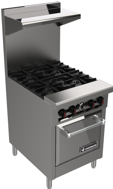
Model R 24 ST - 24 B