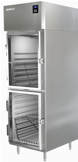
6025XL-GH *Left hinge option shown