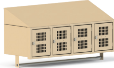
EL-4-18-P-T-STGR Slant Top & Garment Rod Options