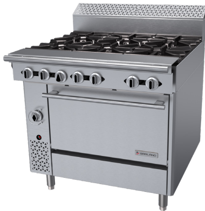
Model C36-6R Range with 6 Open Burners