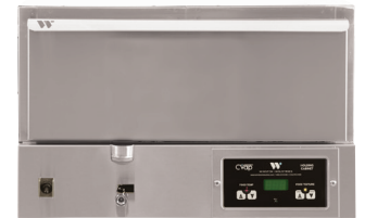
HBB0D1 CVAP HOLD/SERVE DRAWER Electronic Differential Controls