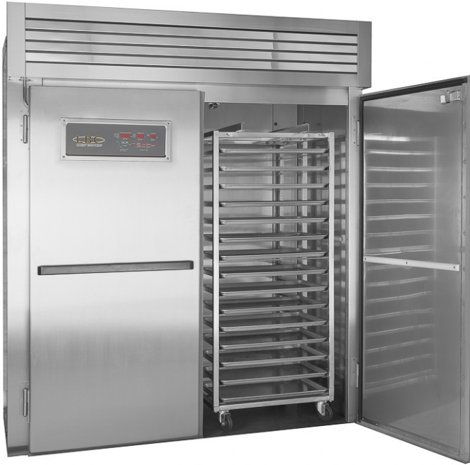
LRPR3-30HO (Rack not included)