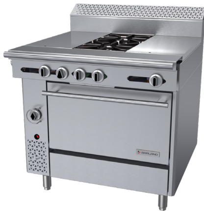
Model C36-12R Range with Two Hot Tops and Two Open burners