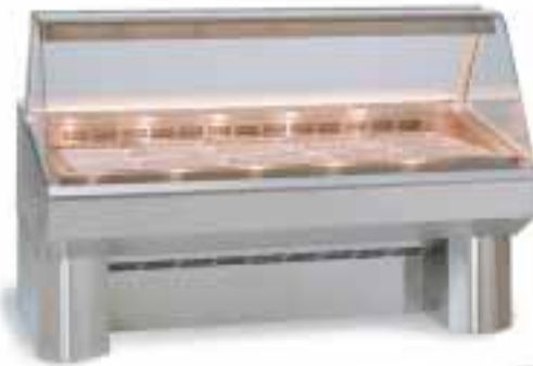
The classic look of an 8' closed pedestal Hot Market Series display