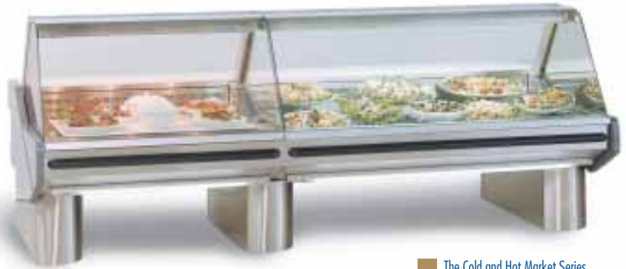
The Cold and Hot Market Series lineup with open pedestals for an ultra-modern look