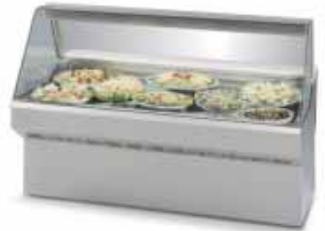
Streamline 45° and 90° corners add configuration flexibility