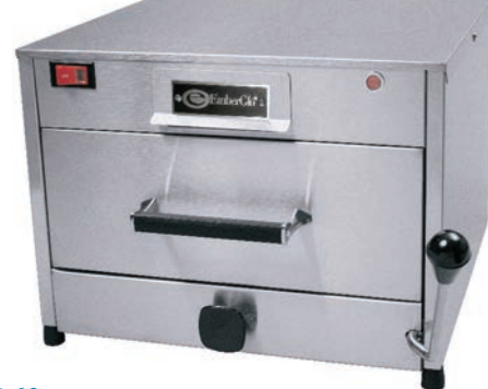
Model AR60 (Manual Pump Shown)