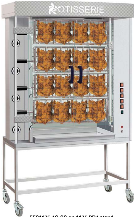
FFS1175-4G-SS on 1175 PR4 stand

The FauxFlame Spatchcock is Rotisol's response to commercial needs for performance accompanied by light weight, minimal size, and mobility. FauxFlame Spatchcock rotisserie ovens offer rapid cooking and quality results with the attractive display and mouth-watering aromas that customers love to find in the marketplace.