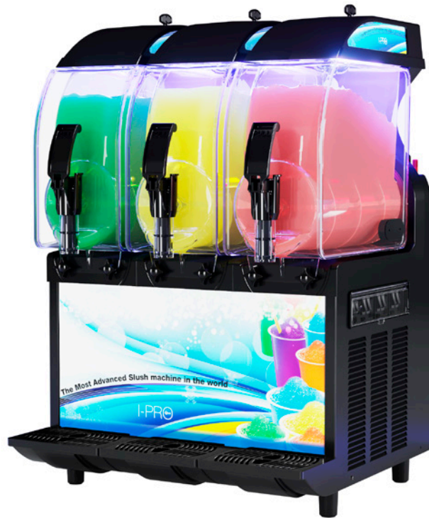
Model I-PRO 3M UV with light panel