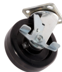
Phenolic Wheels on the EC-3-3048/2ADJ