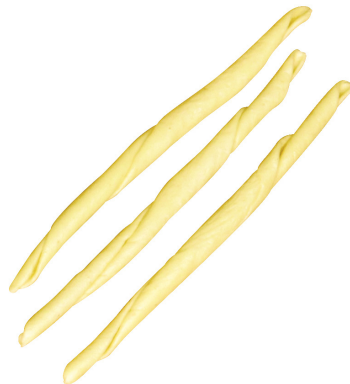
Maccheroni Al Ferro