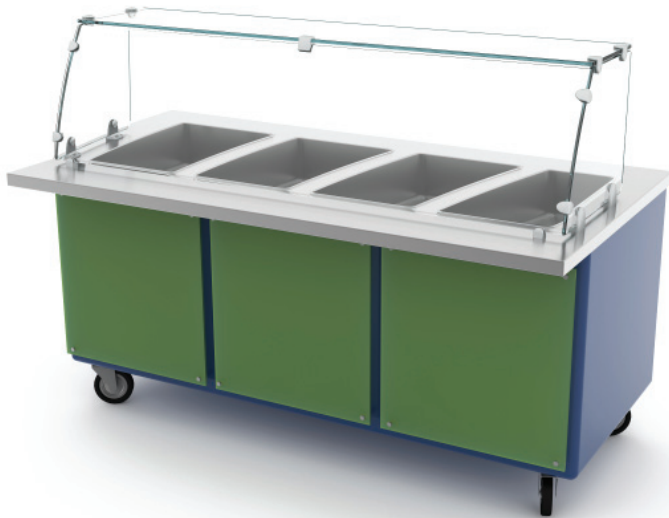
SL-66-QSCHP-4-F shown with options: (OP) offset panels, (TEW) top width extension, and tempered glass protector.