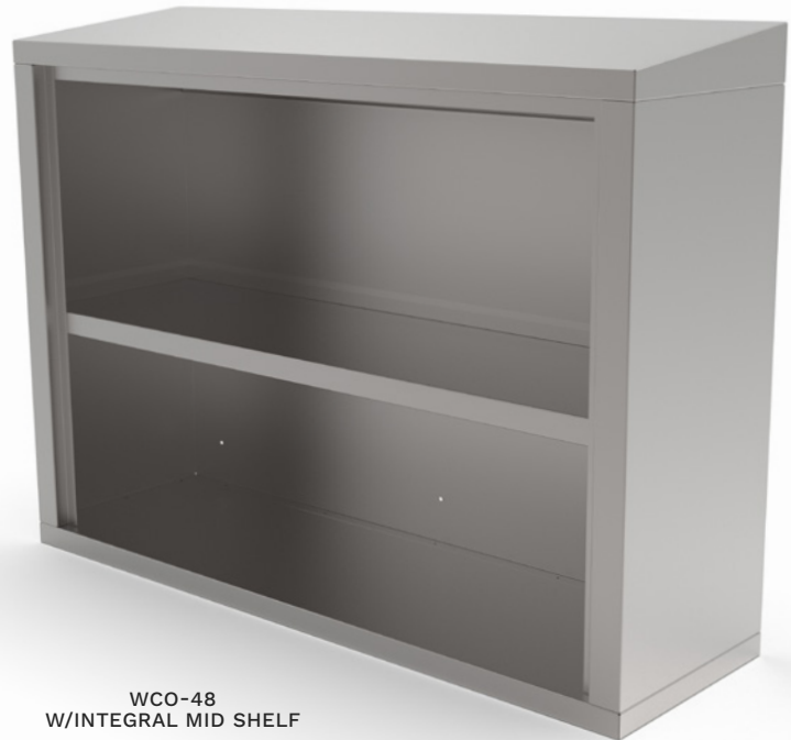
WCO-48 W/INTEGRAL MID SHELF