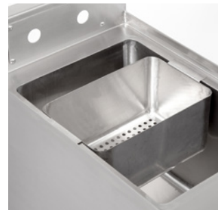
PERFORATED DUMP BASKET (INCLUDED)