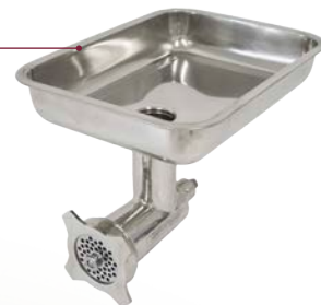
AE-G22NH Grinder Head