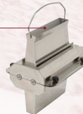
AE-TS12H Meat Tenderizer