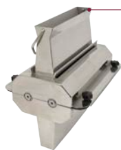
AE-JS12H Jerky Slicer