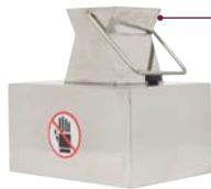
AE-MC12NH Meat Cutter