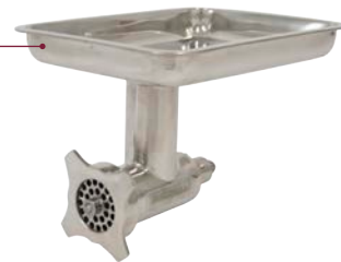
AE-G12NH Grinder Head