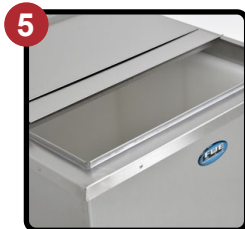
Stainless Steel Sliding Cover