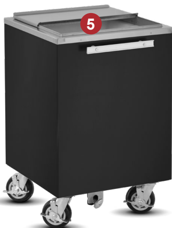
IC-200 PROFESSIONAL SERIES (LAMINATE) MATTE BLACK FINISH