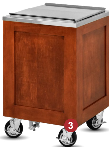
ES-IC-200 EXECUTIVE SERIES (MAPLE WOOD) CHERRY FINISH