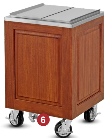
AS-IC-200 ARCHITECTURAL SERIES (MAHOGANY WOOD) CHERRY FINISH