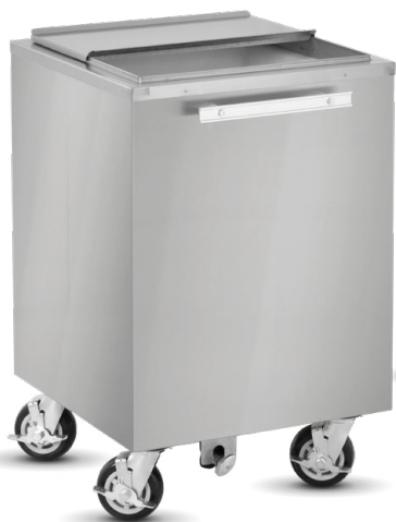
SIC-200 WEATHER-ALL SERIES (STAINLESS STEEL)