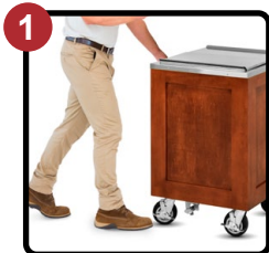
Made for Mobile Applications