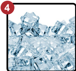
200lb Insulated Ice Storage