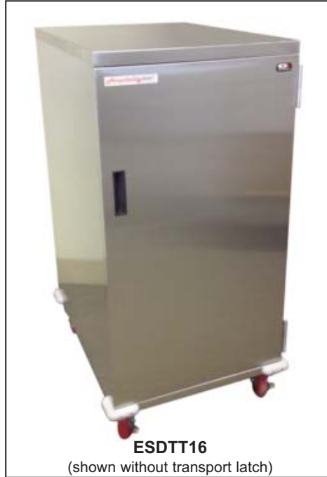
ESDTT16 (shown without transport latch)

Since 1947, Foodservice Equipment That Delivers!