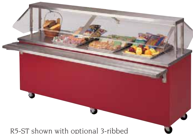
R5-ST shown with optional 3-ribbed tray slide and BPG protector guard

The Reflections Solid Top units are ideal for use as worktops, for plating and for sandwich and salad preparation. This unit can also be used as a counter for other serving and merchandising needs.