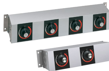
RMB-14E with infinite controls