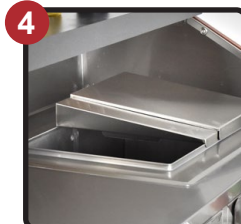
60lb Ice Bin with Drain