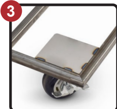
Tubular Welded Base Frame