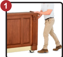
Made for Mobile Applications