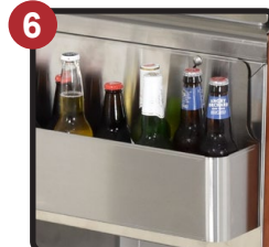
Removable Bottle Speed Rail