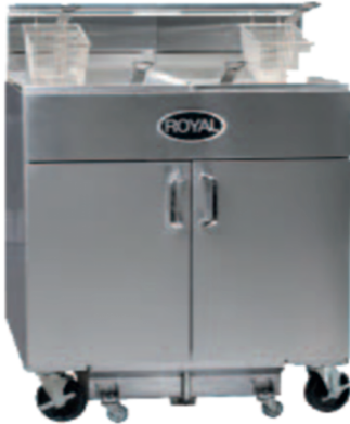
REEF-35-2-EM with optional casters

Models: REEF-35-2-XX REEF-35-3-XX REEF-35-4-XX REEF-35-5-XX