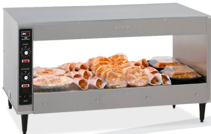
SM-39 model shown

The BKI® SM-27 countertop warmer features a pass-through design, a single horizontal shelf, and a ceramic infrared top heat combined with base bottom heat to keep food fresh and hot for extended times.