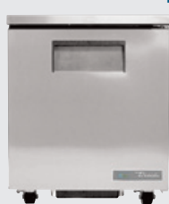
ADA 34" height (864 mm)