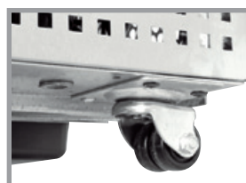
1 1/2" diameter dual swivel castors for "LP" models.