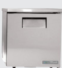
Low Profile 31 7/8" height (810 mm)