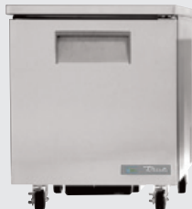
Standard 36" height (915 mm)