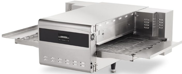
THE CONVEYOR C2600